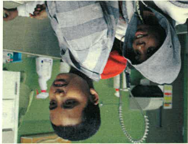
In his early years (Above)