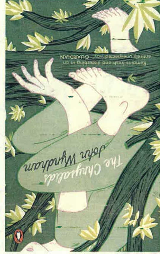
Cover of The Chrysalids, Penguin edition

I can't wait to read about what happens next!